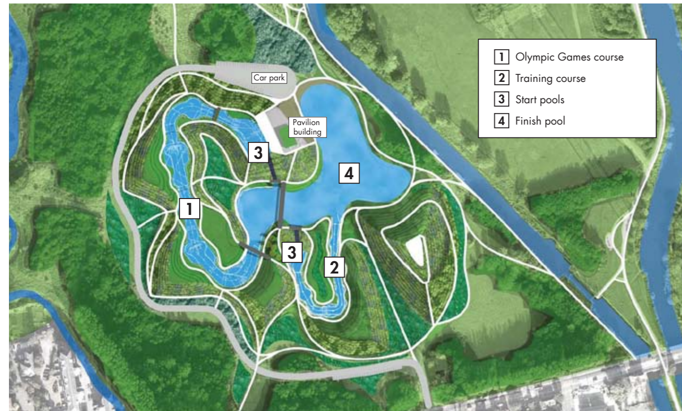
Broxbourne White Water Canoe Centre

After the Games, temporary Games-time structures, such as seating will be removed. It will become a major leisure attraction for white water rafting, managed by Lee Valley Regional Park Authority.