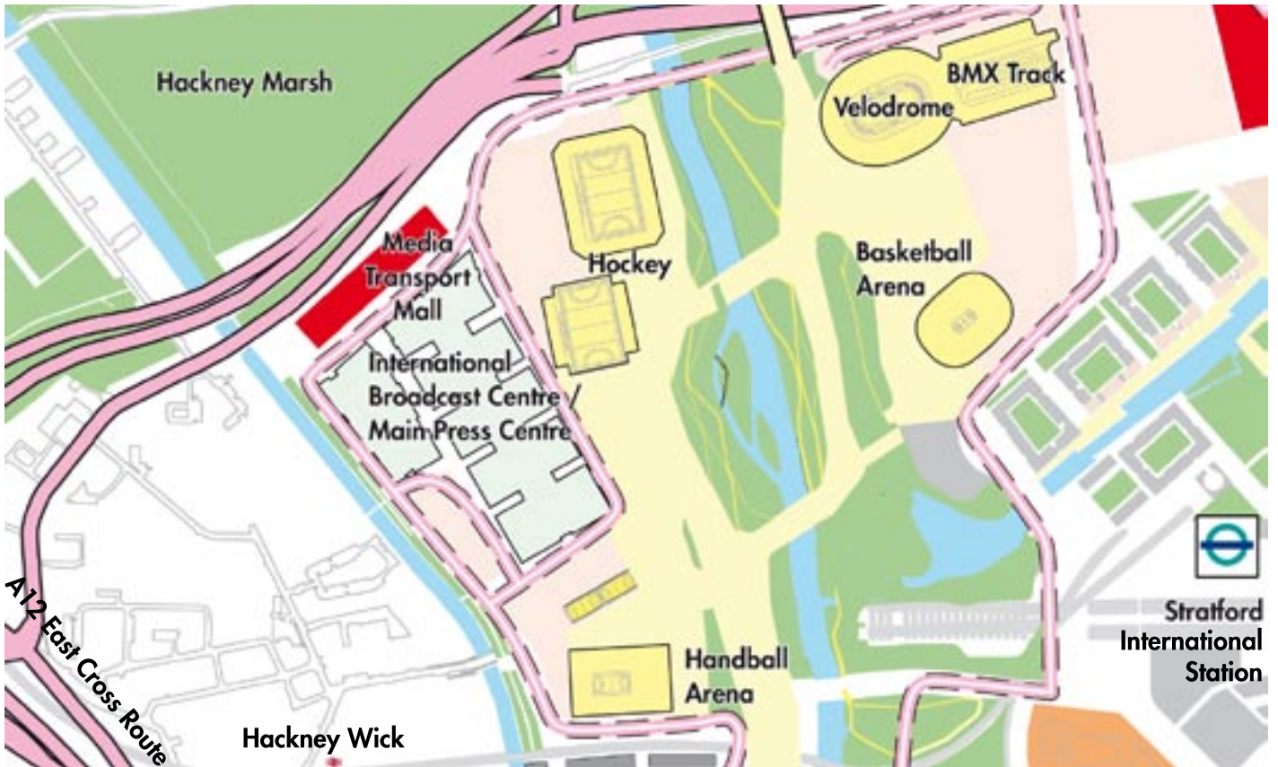
Location of the VeloPark and Handball Arena on the Olympic Park during the Games