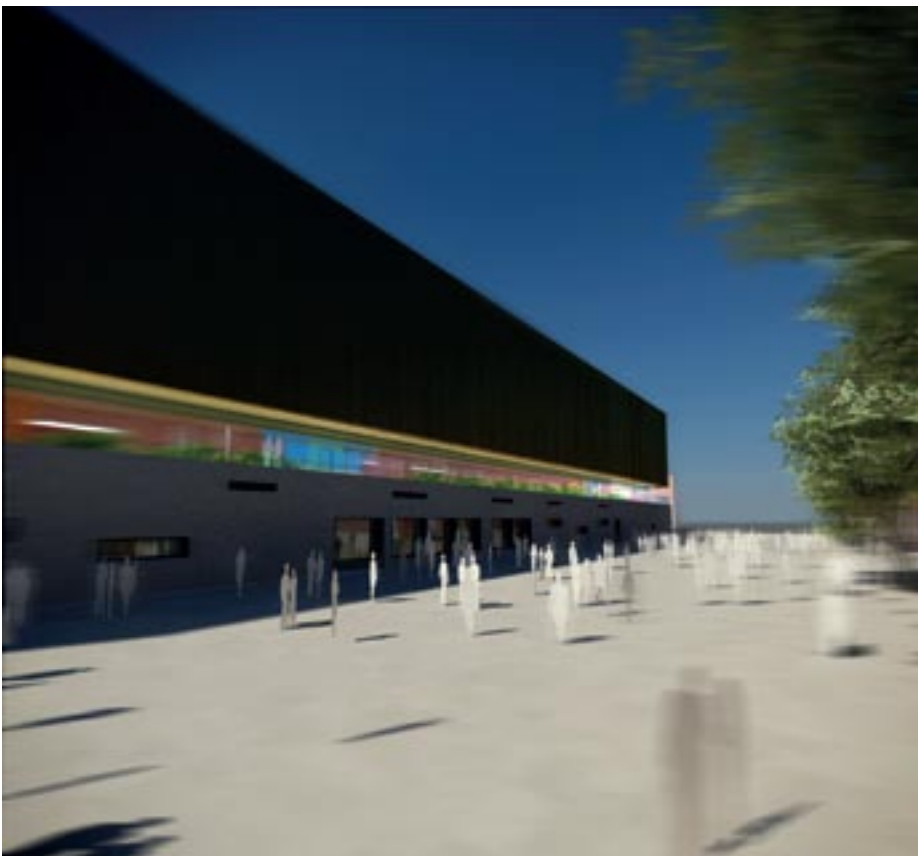
Concept design of the London 2012 Handball Arena

After the Games, the Arena will be used as a multi-sports venue for use by the community. The venue will also be used by elite squads and athletes for training. It will also provide a venue for a variety of local, regional, national and international events.