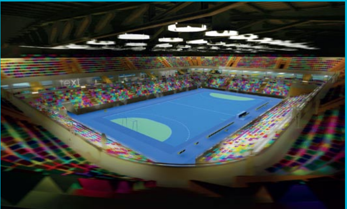
Concept design of the Handball Arena during the Games

Planning submission for Handball Arena Construction due to start