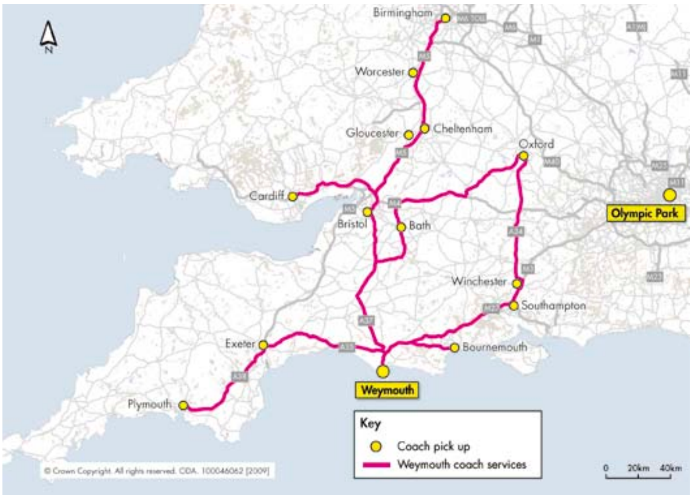
Proposed direct coach services to Weymouth and Portland

Shuttle service frequency will be determined through the spectator management process and adjusted according to demand for each venue.