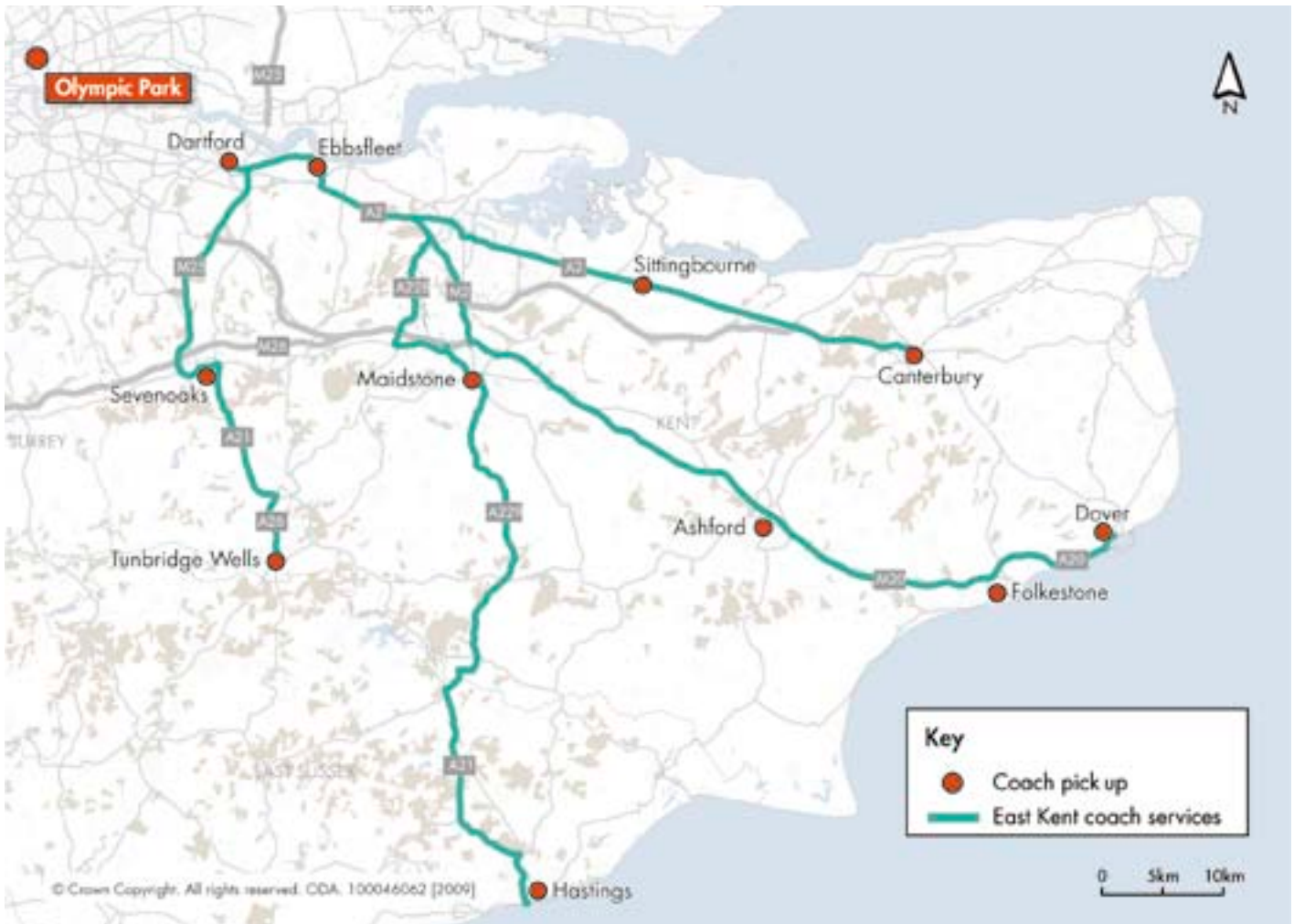
Proposed direct services from East Kent

As well as scheduled services, we will be catering for charter buses and coaches hired by groups or third parties. Pre-booked permits will be issued to these operators to provide arrival and collection times at venues.