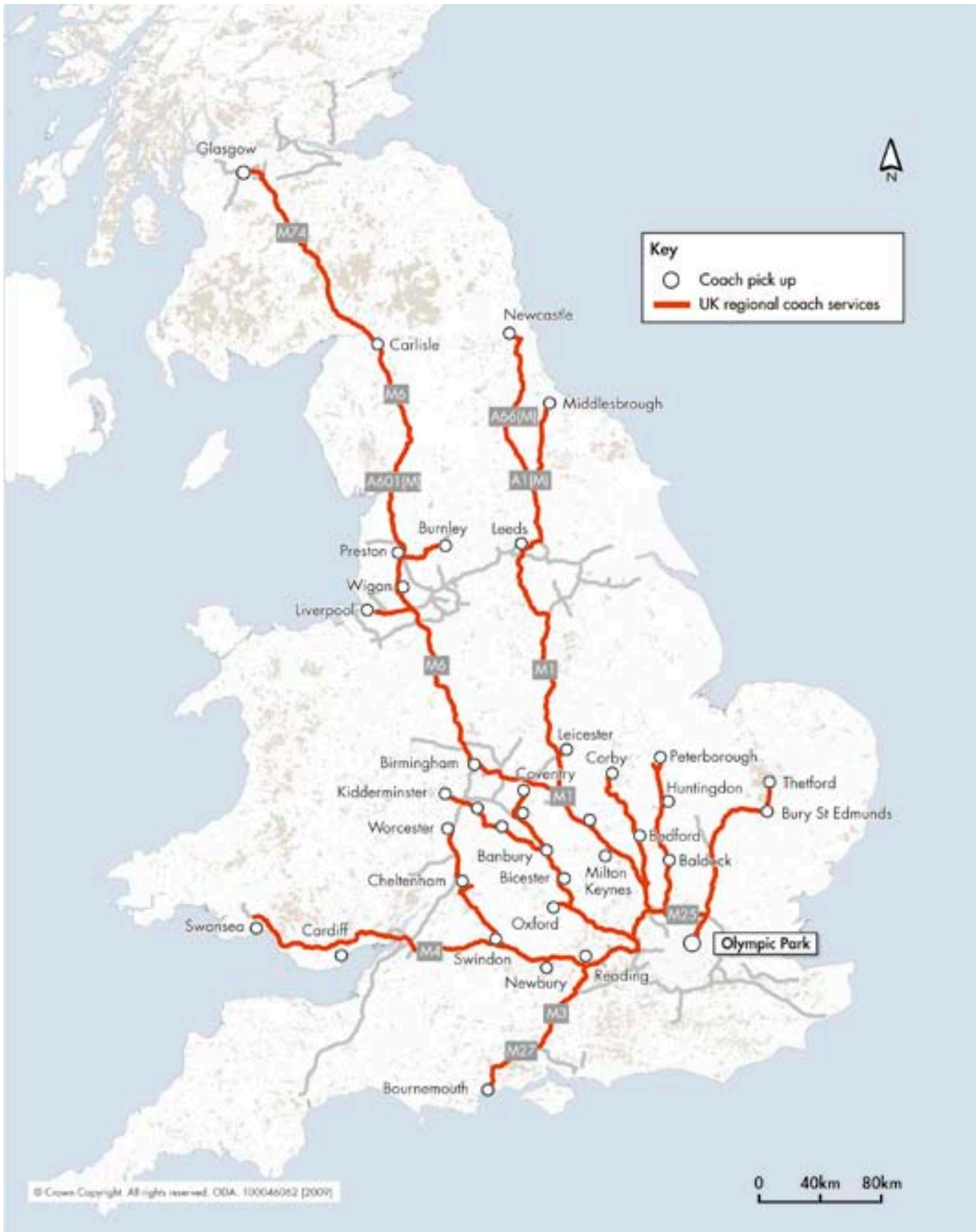
Proposed longer-distance direct coach services to the Olympic Park