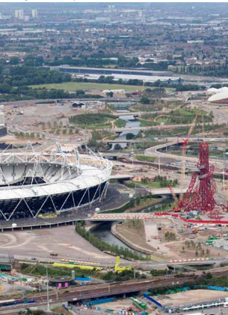
g south to north.