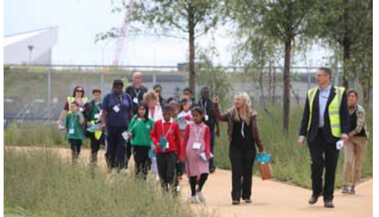
Local residents and students joined us in July 2011 to see the progress made on the Olympic Park's parklands.