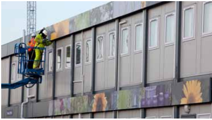
Photos of Leabank Square's waterside garden were enlarged to help decorate the site offices.