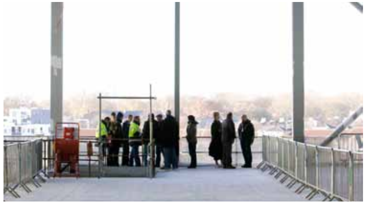
Open days for the local community to visit the International Broadcast Centre were held in 2009 and 2010.