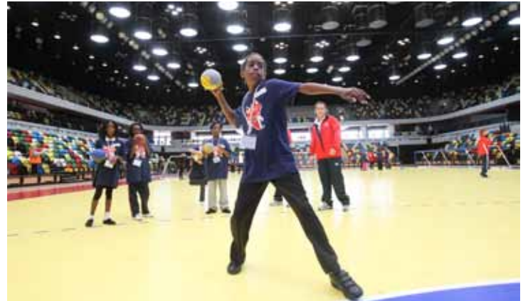
Students from Gainsborough Primary School were the first to use the completed Handball Arena in June 2010.