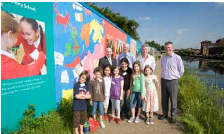
450 children took part in the 2008 competition to produce images to be shown on the blue hoarding around the Olympic Park site.