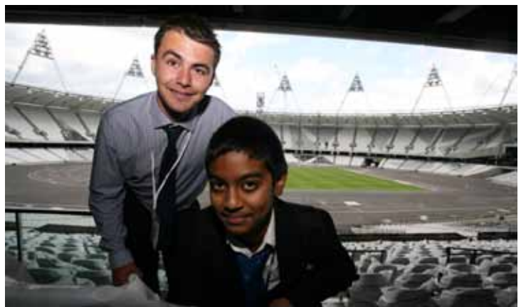
The three-year Construction Crew ambassador project grew from 20 to 100 students, representing 60 different east London schools.