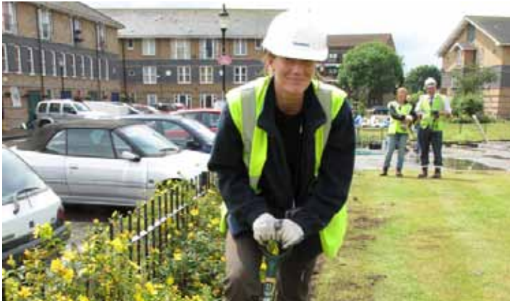
ODA and contractor staff help create flowerbeds in Leabank Square as part of London 2012 Sustainability Week.

Over the last few years we have worked with local people living around the Olympic Park in a number of different ways. Along with doing our best to minimise the impact of construction, we have worked with you on and off the Park, at events and volunteering days, on visits and through the Education Programme. Here are some of the highlights!