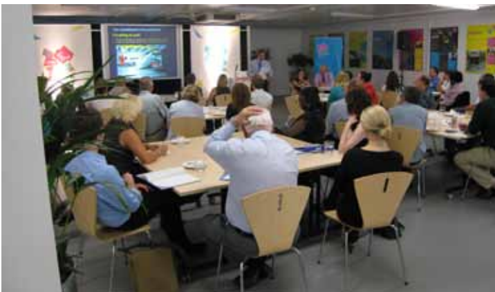
Olympic Park Engagement Network (OPEN) meetings will now be managed by the OPLC. The ODA began OPEN more than three years ago, along with other regular public meetings.