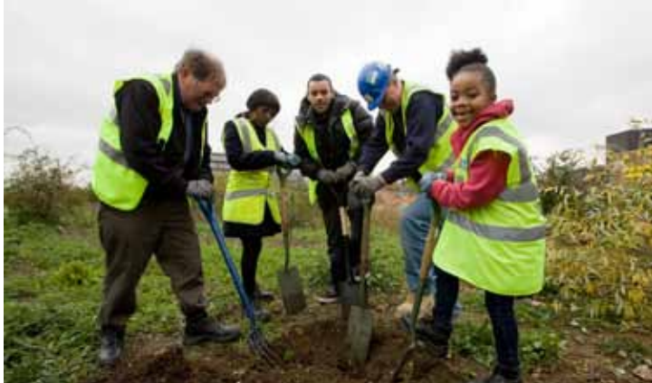
417 Wick Lane, Omega Works and Iron Works residents were amongst those who volunteered to help plant shrubs and flowers along The Greenway.