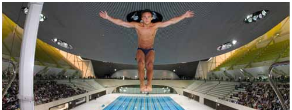
Local residents and schoolchildren joined us at the Aquatics Centre to watch Tom Daley perform the first dive. The Aquatics Centre was the last of the six main Olympic Park venues to be finished.

Community Relations team Olympic Delivery Authority