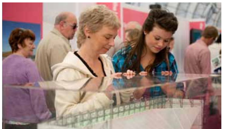
Tens of thousands of local residents have visited the Olympic Park by bus and over our annual Open House weekends. Local people were trained to become ODA tour guides.