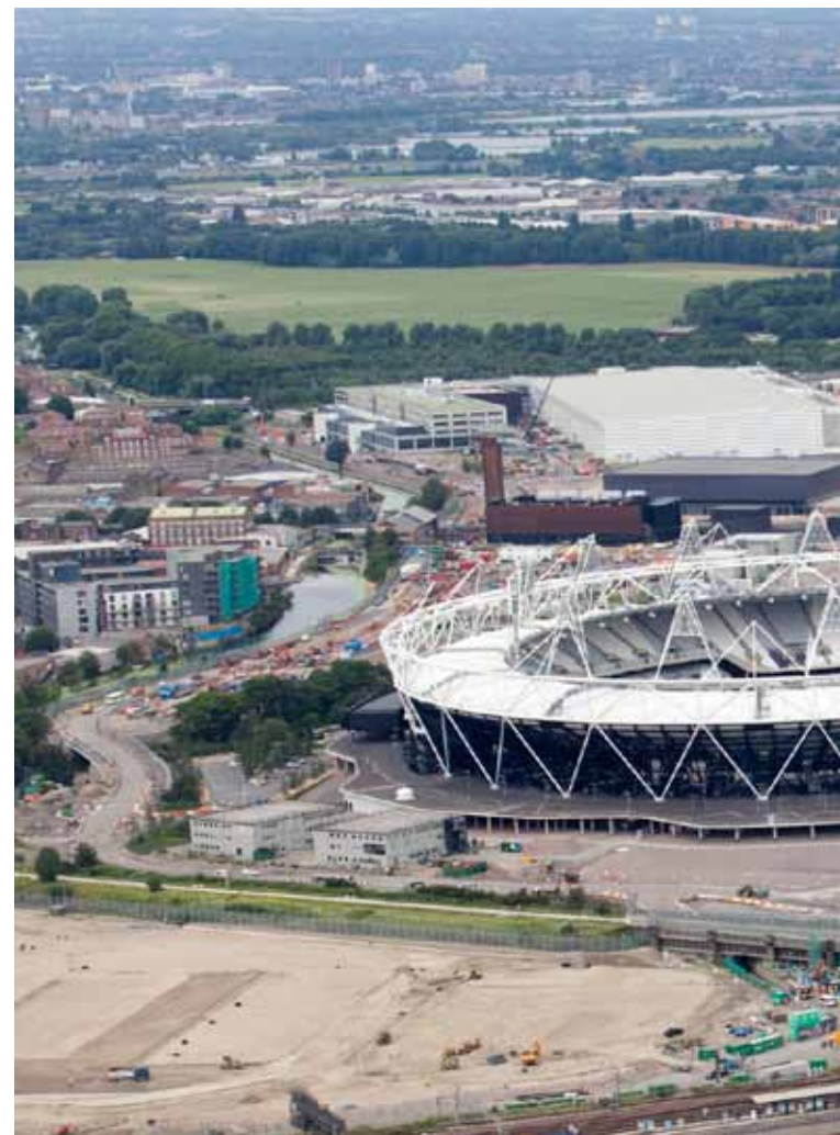
Panoramic aerial of the west of the Olympic Park in July this year, looking