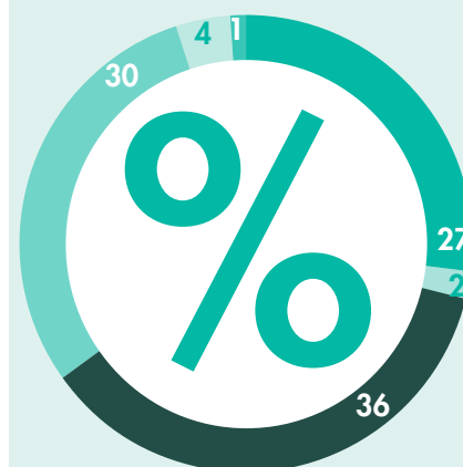
Athletes' Village contractor workforce in June 2011