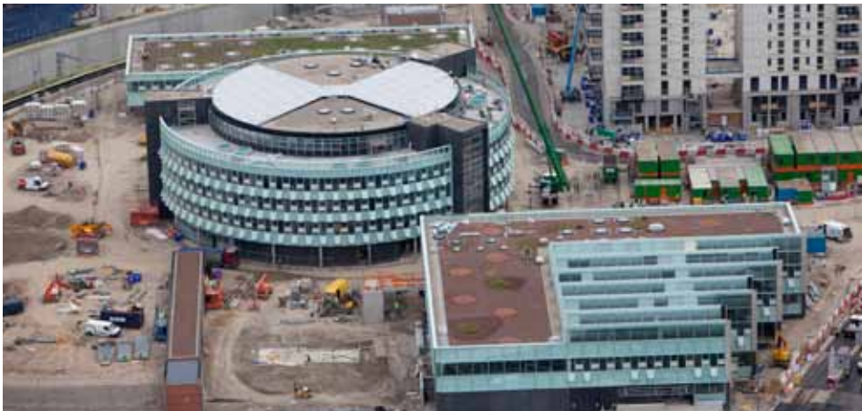
An aerial view of the Chobham Academy in the Athletes' Village in July 2011