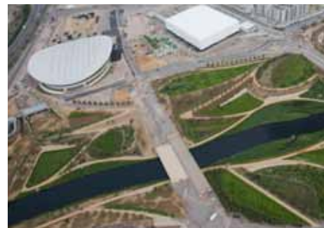
An aerial view of the parklands

The waterglades are almost complete. This space will be enjoyed for many years to come by those living at the Village as well as local communities and people visiting the area.