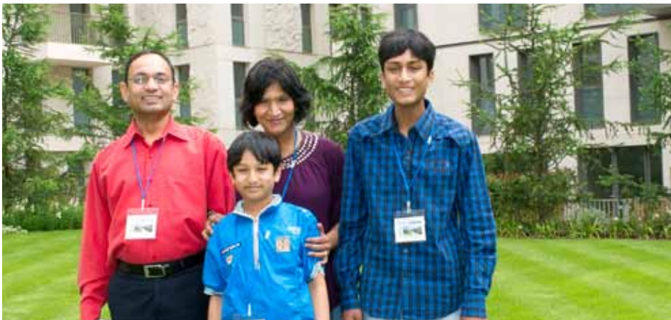
Local residents visit the Athletes' Village in July 2011