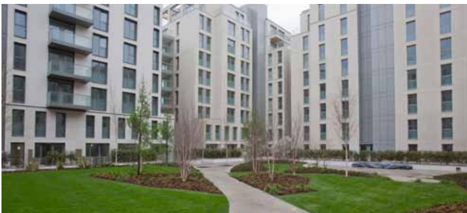
The first of the 11 residential plots on the Athletes' Village was completed in March 2011