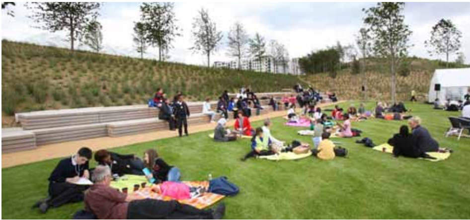
Local residents and schoolchildren enjoy the first 'picnic in the Olympic Park' in June 2011