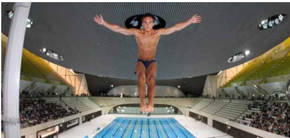
Local residents and schoolchildren joined us at the Aquatics Centre to watch Tom Daley perform the first dive. The Aquatics Centre was the last of the six main Olympic Park venues to be finished.

Community Relations team Olympic Delivery Authority