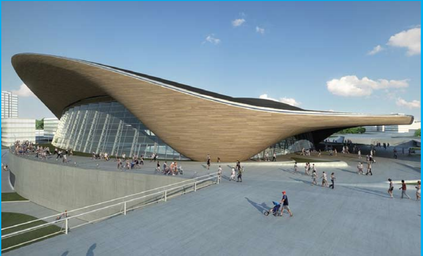
Aquatics Centre after the Games: approach from Stratford City