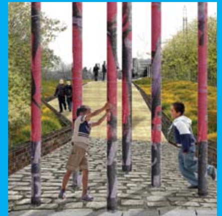
Ideas from the design competition for the Greenway

The redesign of the Greenway will help us meet our aim of getting all spectators to the Games by public transport, walking or cycling.