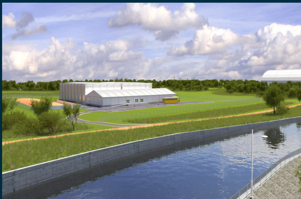
An artist's impression of the temporary Basketball training venue

October 2012 – Dismantling will be completed, the reinstatement works finished and the land will revert to LVRPA control